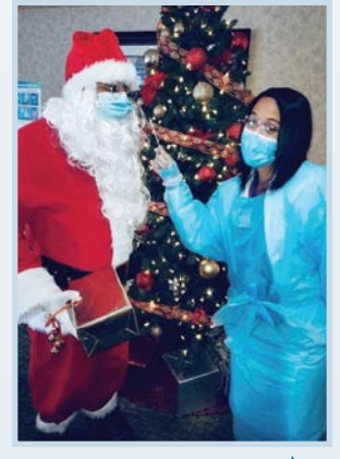
Santa prepares for his COVID test at The Laurels of Walden Park.