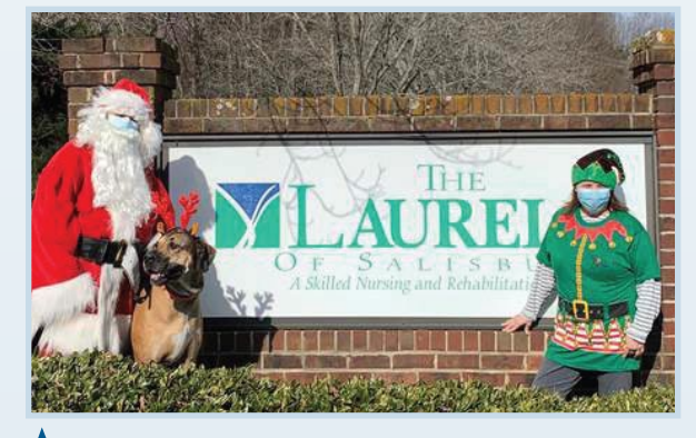
A Very Good Reindeer joined Santa and his elves at The Laurels of Salisbury .

Guests at The Laurels of New London loved the snowman display built by Stein Hospice's Snowman Brigade. Who better than Frosty to make things merry?