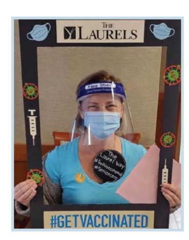
Associates at The Laurels of Pender are all smiles under their masks after the facility's COVID-19 clinic.