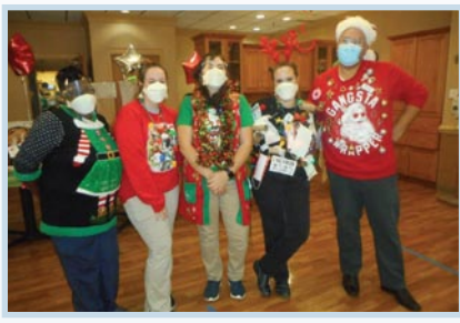
The Laurels of University Park

Guests and Associates at The Laurels of University Park showed off their fall colors and expressed gratitude for the season at their Thanksgiving photo shoot.