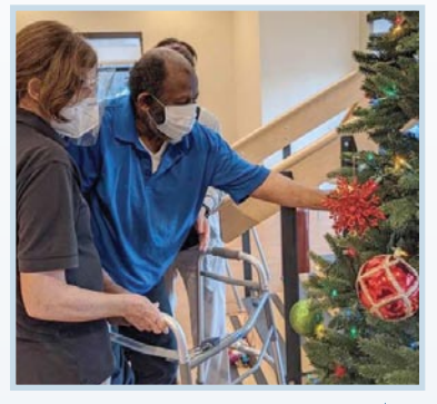
Guests and Associates at The Laurels of Willow Creek admire the tree.

At The Laurels of Steubenville Santa and his elf stopped by for a window visit.