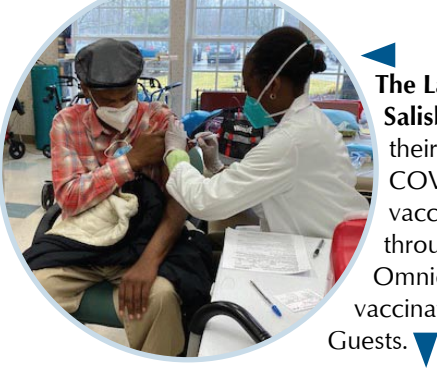
The Laurels of Salisbury hosted their second COVID-19 vaccine clinic through CVS Omnicare to vaccinate staff and