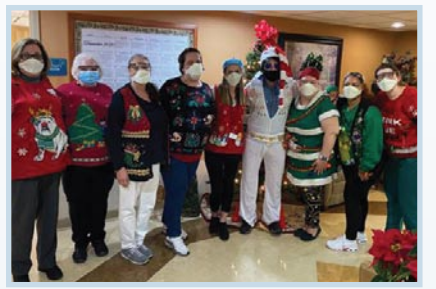
The Laurels of Hilliard