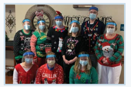
The Laurels of Hillsboro

Our Associates always work hard to make the holidays merry for Guests and coworkers alike. The Ugly Christmas Sweater competition is a cherished tradition at many of our facilities!