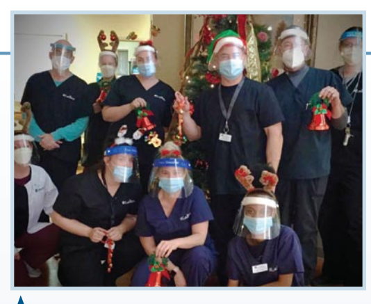
Associates at The Laurels of Huber Heights rang in the holiday season with bells and PPE.