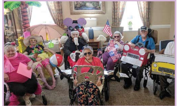
Guests at The Laurels of Hendersonville really enjoyed the wheelchair decorating contest during National Skilled Nursing Care Week.