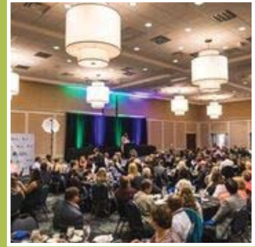
Celebrating success at the Annual Management Meeting Awards.

The Laurels of Hillsboro The Laurels of Huber Heights The Laurels of Kent The Laurels of New London The Laurels of Norworth The Laurels of Salisbury The Laurels of Sandy Creek The Laurels of Steubenville The Laurels of University Park The Laurels of West Carrollton The Laurels of Willow Creek The Laurels of Worthington Maplewood of Marshall Maplewood of Mt. Pleasant Maplewood of Shane's Village