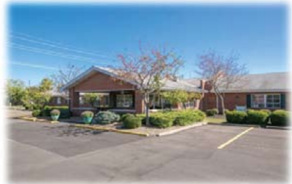
The Laurels of Heath