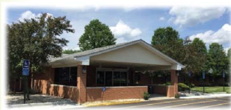
The Laurels of Milford