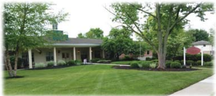
The Laurels of Middletown