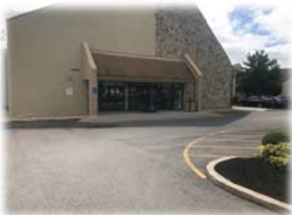
The Laurels of Walden Park