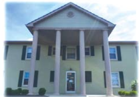
The Laurels of Hamilton