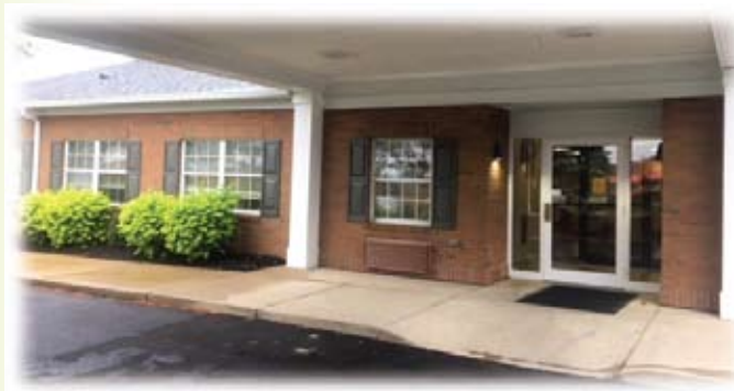
The Laurels of Gahanna